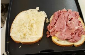
Ruben Sandwich Lunch 12PM to 2PM